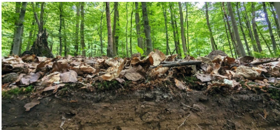
Figure 8 The forest floor and intensively rooted topsoil: the place where organic matter is transformed, most of the soil organisms live and where nutrients are recycled.

The National Forest Soil Inventory (NFSI) provides information about the current state and the changes of our forest soils. For this purpose, soil, forest-stand and vegetation data are collected on 8 km x 8 km grids at 1,900 sites across Germany . The NFSI takes place approximately every 15 years. The field assessments of the third NFSI are currently in progress.