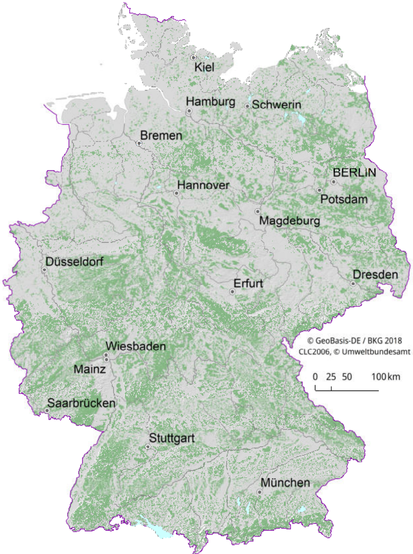
Figure 1 Forest covered area of Germany.

Almost one third of the area of Germany (11.4 million hectares) is covered by forest. Thus, forest soils play an important role in our landscape, providing fundamental functions and ecosystem services to forests and their water and nutrient cycles.