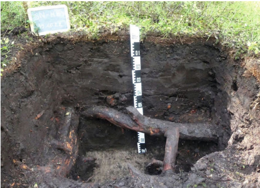
Figure 7 Drained Histosol (Sapric Murshic Histosol (Dystric)) with tree-root remains in the Ore Mountains.

The proportion of Histosols (i.e., peat soils) and other humus-rich wet soils in the soil cover under forest is approximately 2.4 %. The major part of the peatland and wet soils has been subject to artificial drainage. Even though Histosols make up only a small area, they act as an important carbon storage, and as a relevant CO 2 source in case of drainage. Their rewetting offers potential for climate-change mitigation and biodiversity conservation.